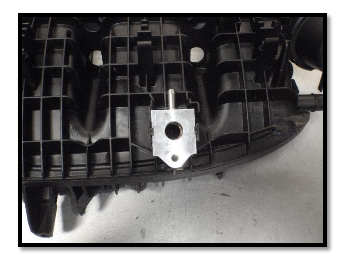
Step 3. Push down on the boost tap until it clicks into place and push on the vacuum hose.