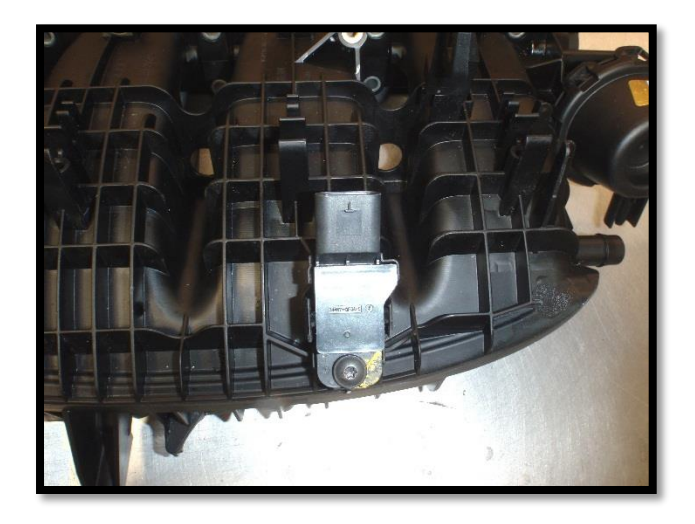
Step 1. Remove the MAP sensor from the inlet manifold.